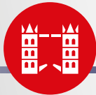
Central London 11 Miles