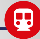
Waddon Train Station 6 Minutes' Walk