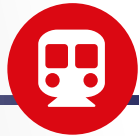
Wandle Park Tram Stop 15 Minutes' Walk