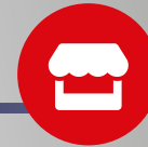
Croydon Shopping Centre 1.5 Miles