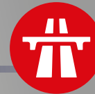
M25 J7 8 Miles