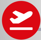
Gatwick Airport 18 Miles