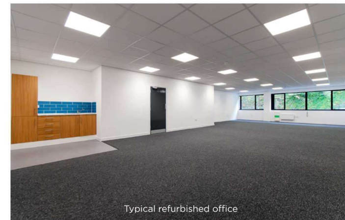
Typical refurbished office