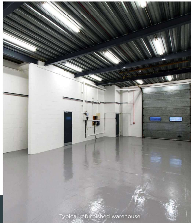
Typical refurbished warehouse