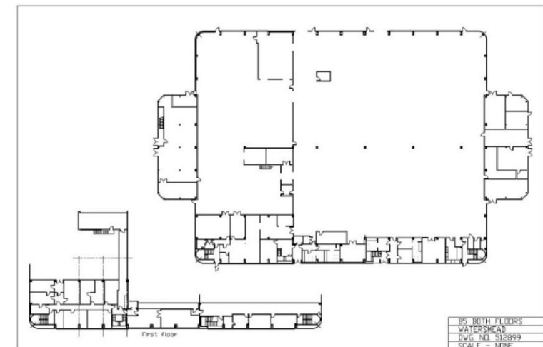
Building 5 – Ground and First Floor Plan