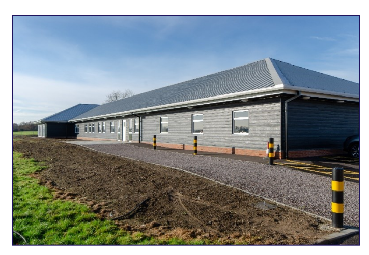
Internal Courtyard Car Park External Projection