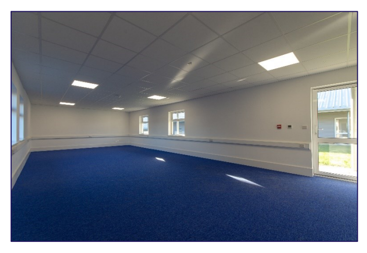
Small Office Suite Large Open Plan Office Suite Internal Suite