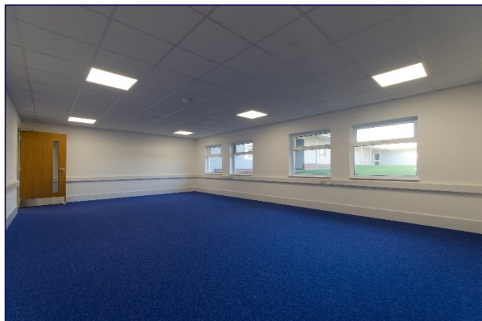
Small Office Suite