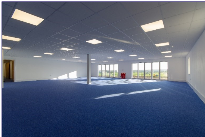
Large Open Plan Office Suite