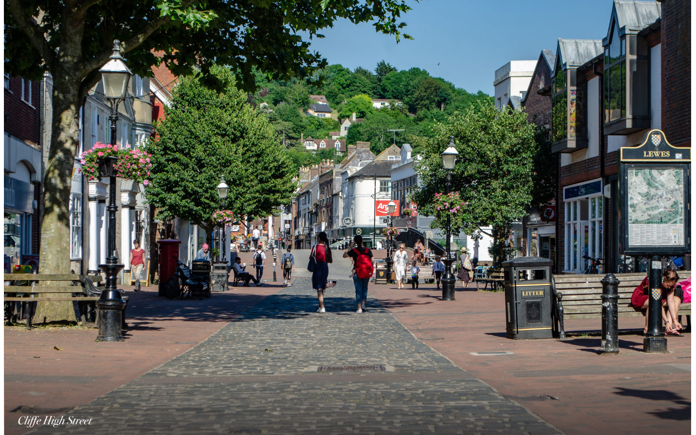
Cliffe High Street