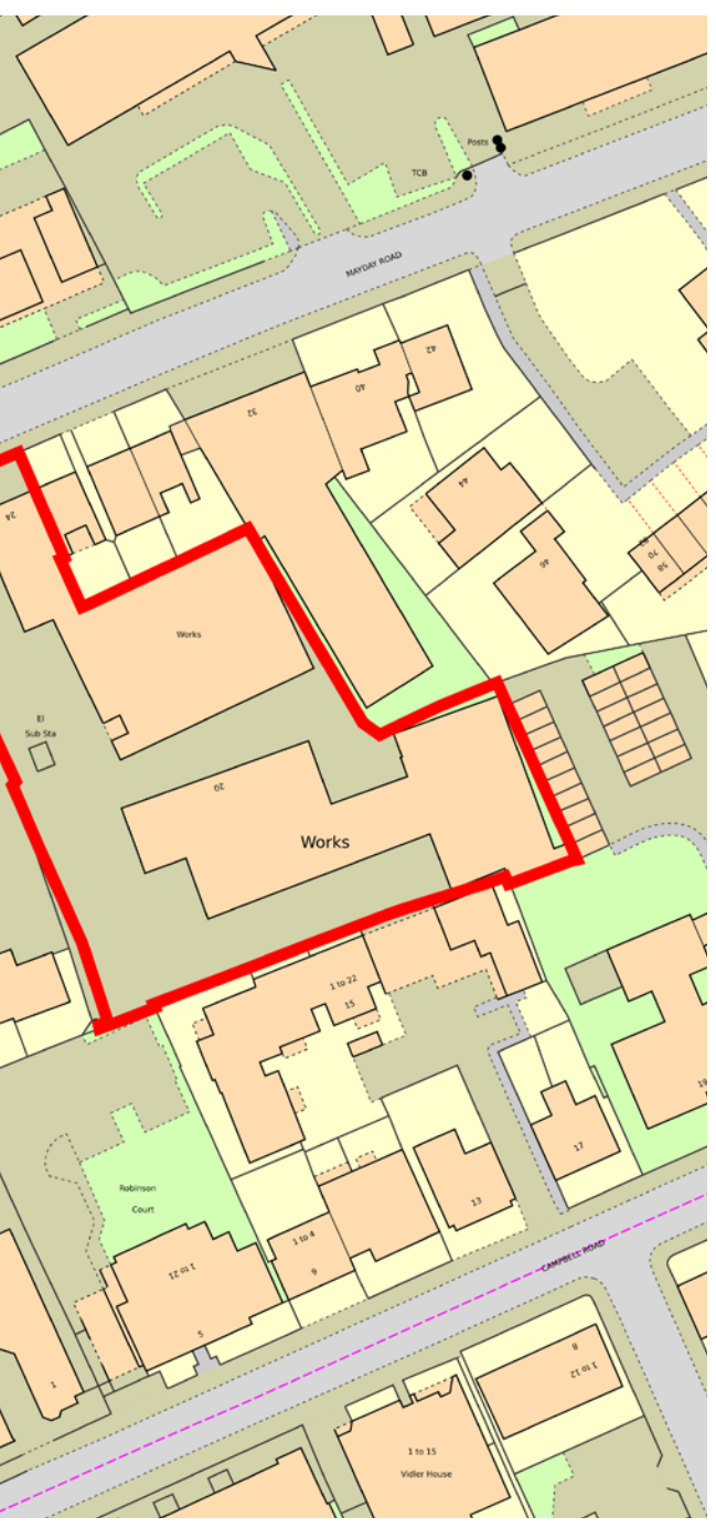
Site outline for identification purposes only.