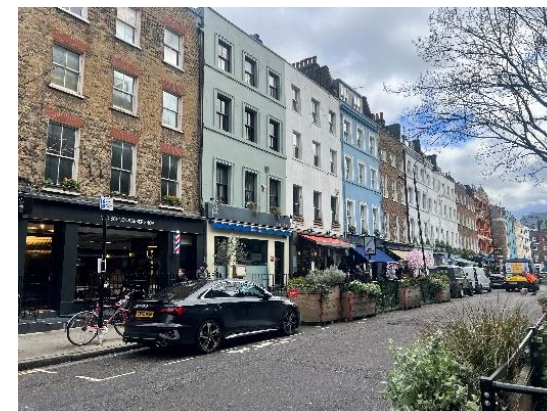
Local amenities such as Old School Barber Shop, Lisboeta, Pied à Terre and Goode Flowers are just on your doorstep.

Each party is to be responsible for their own legal fees.