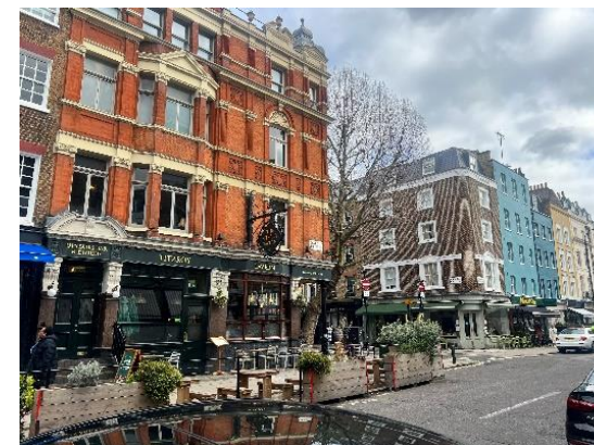
The Fitzroy Tavern located the other end of Charlotte Street, great for after work drinks or celebrations