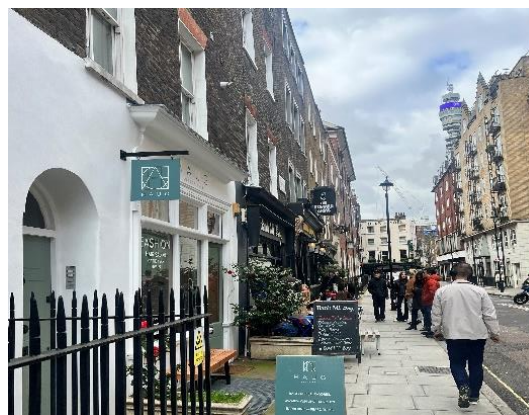
Haug London Haus, Banh Mi Bay and The Newman Arms are all located a short walk away on Rathbone Street