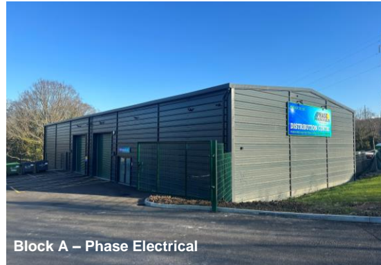
Block A – Phase Electrical