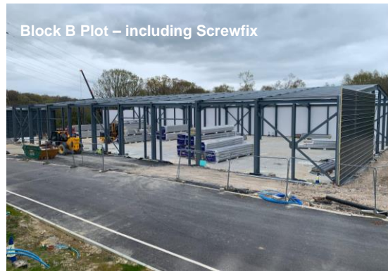
Block B Plot – including Screwfix