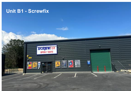
Unit B1 - Screwfix