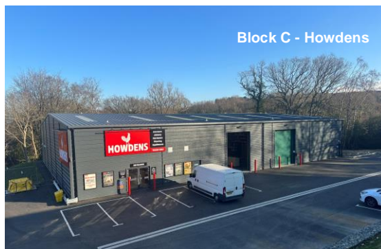
Block C - Howdens