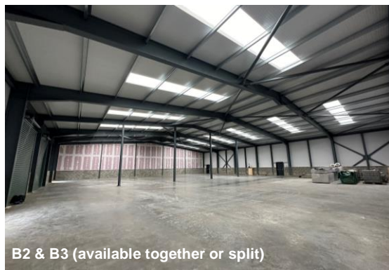
B2 & B3 (available together or split)