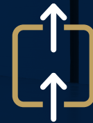
POTENTIAL FOR CROSS LOADING