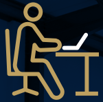
GROUND FLOOR OFFICES