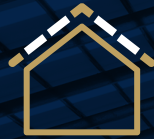
NEW TRIPLE-SKIN GRP ROOF LIGHTS