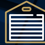
ROLLER SHUTTER DOORS