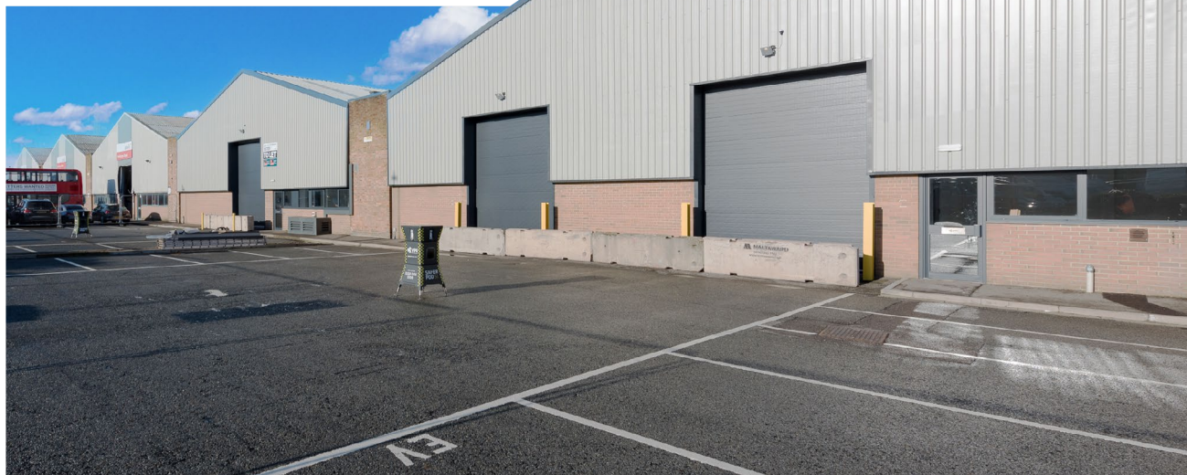
BEDDINGTON CROSS, BEDDINGTON FARM ROAD, CROYDON, SURREY CR0 4XH