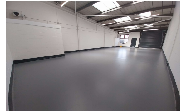
Photos are indicative of a refurbished unit on the estate.