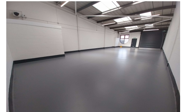
Photos are indicative of a refurbished unit on the estate.