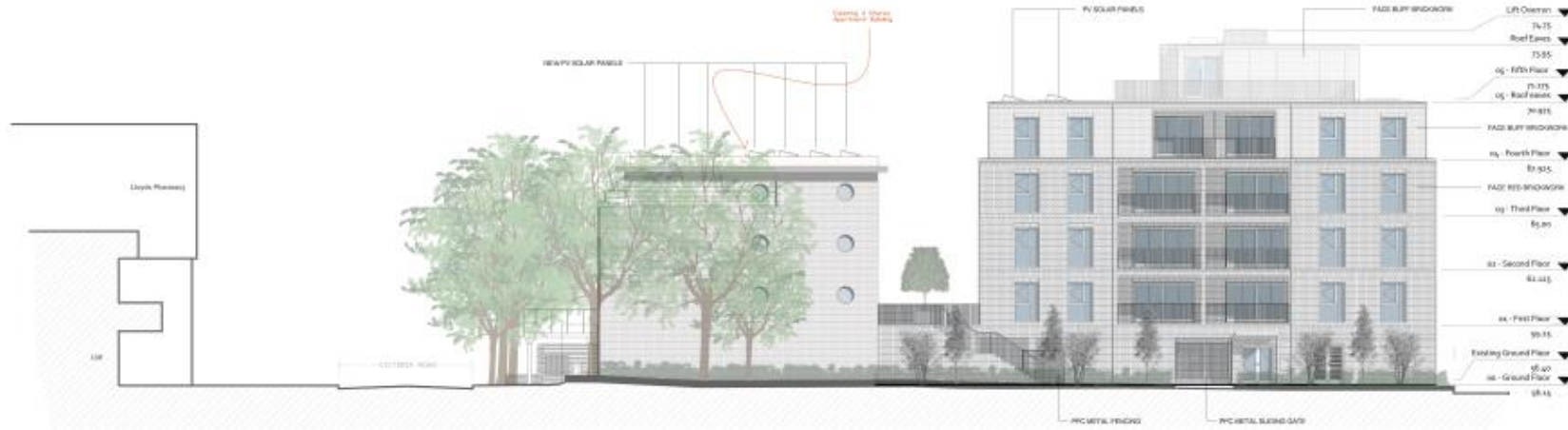
Proposed West - Elevation